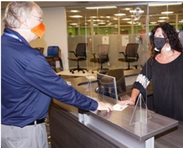
Item #30SP 20 0048 FREE STANDING SAFETY BARRIER 32" x 32" $129.45

VCE manufactures Lexan (polycarbonate sheeting) protective safety barriers for use in offices, public buildings and other state facilities. These protective barriers offer protection from the direct spread of airborne droplets.