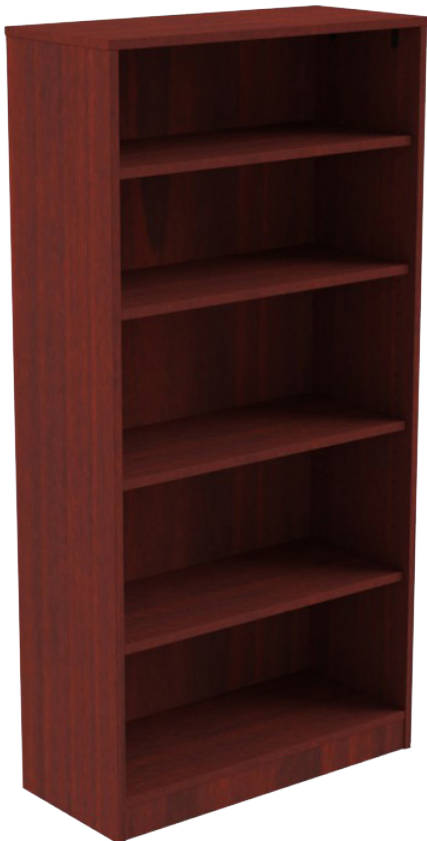
Bookcase. Four Adjustable Shelves