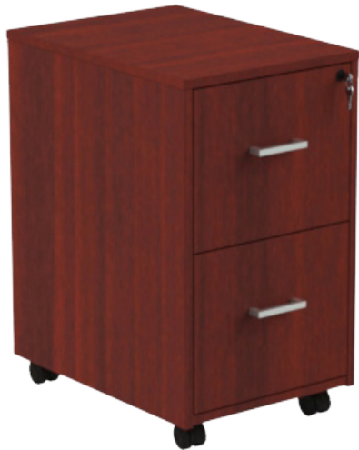
Mobile Pedestal, FF