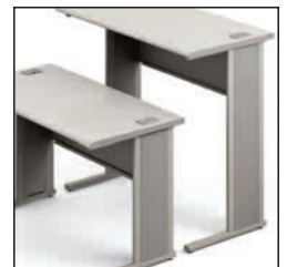
Multiple-Height Worksurfaces - are ideal for walk-up kiosks allowing users to work efficiently from a seated and standing position.