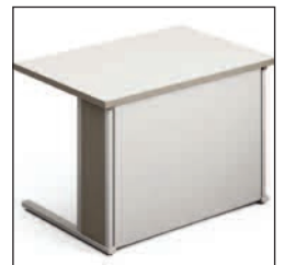
Full Modesty Panel - gives the desking a uniform look from every angle, even when files are stored beneath it.