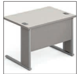
Panel Options - include full and partial modesty panels for privacy in addition to the open beam design.