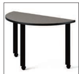
Mobile Worksurface - A variety of movable worksurfaces respond to the need for group meetings where mobility is key.