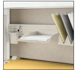
Tool Rail - allows users to locate paper management components wherever they are most convenient.

FlexStation can also be specified with integrated duplex outlets beneath the worksurface. These receptacles are housed in data troughs, which contain steel dividers for power and data separation and doors to keep the contents out of sight. Table-to-table connectors allow a single hardwired electrical connection to provide 10-wire power for an entire group of users with either type of access.