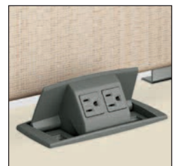
Power/Data Module - contains one pop-up duplex receptacle and two stationary data ports.