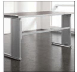
Beam Option - allows access to the building power, data, and communication receptacles when placed against a wall.

With all of its possibilities, your only limit with FlexStation is your imagination.