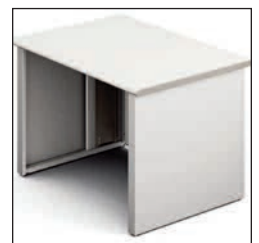
Full End Panel - can be used to finish off worksurface ends or stand alone worksurfaces.