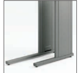
Foot Depth - of transitional legs is decreased to allow easy movement throughout the work area.

Other features that make FlexStation ideal for collaborative training environments are also subtly located beneath the desktop. A shared leg can be used in place of two separate legs to support adjoining worksurfaces and increase the foot room beneath them, while facilitator desks with casters improve instructors' mobility and access to learning boards at the front of the room.