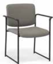
512 Sled base 300lbs capacity