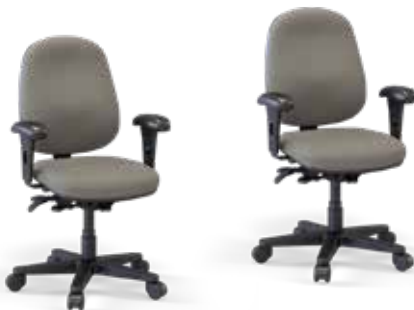
6800ti Mid back