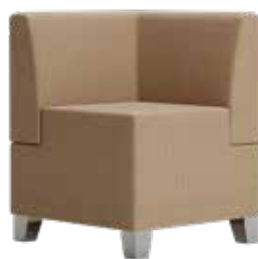
1412 Modular corner chair