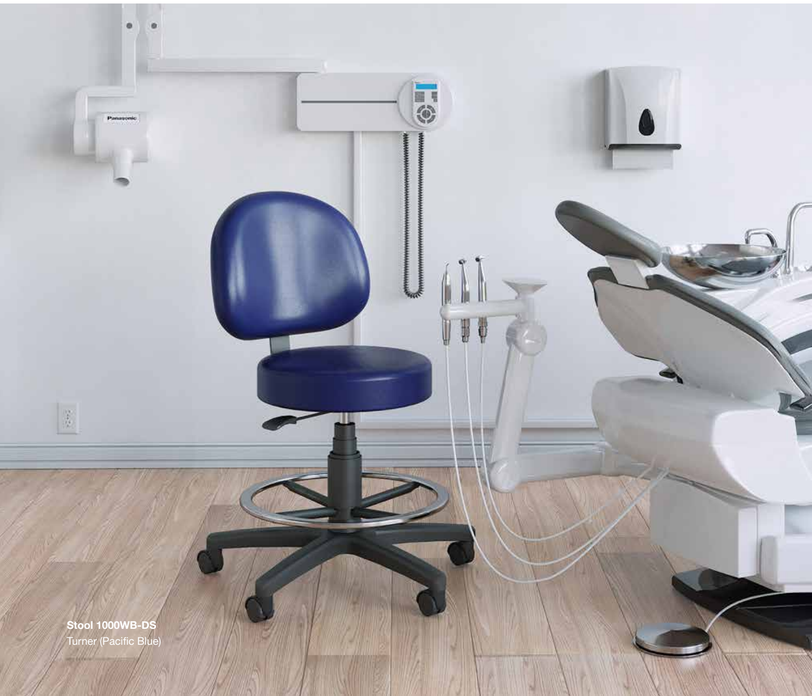
Stool 1000WB-DS Turner (Pacific Blue)

To the point, like its name, Nightingale's Stool is an economical and comfortable chair engineered for use in medical, dental, laboratory, or small-space environments where mobility is essential.