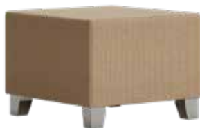
1410 Modular lounge chair