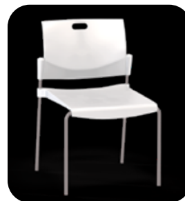
808-WH-CH Stacker without arms