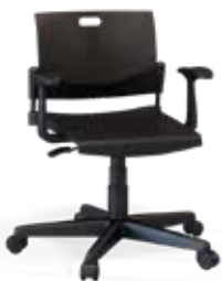
800 Task chair with arms