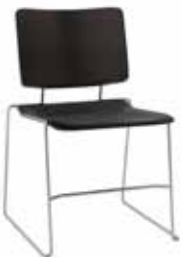
308 High density stacker, armless