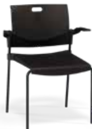
811 Stacker with arms