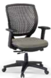
2200 Chair with arms