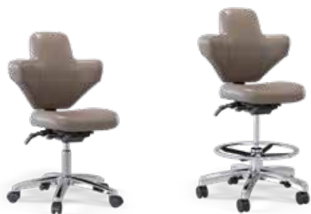
1864 Mid back