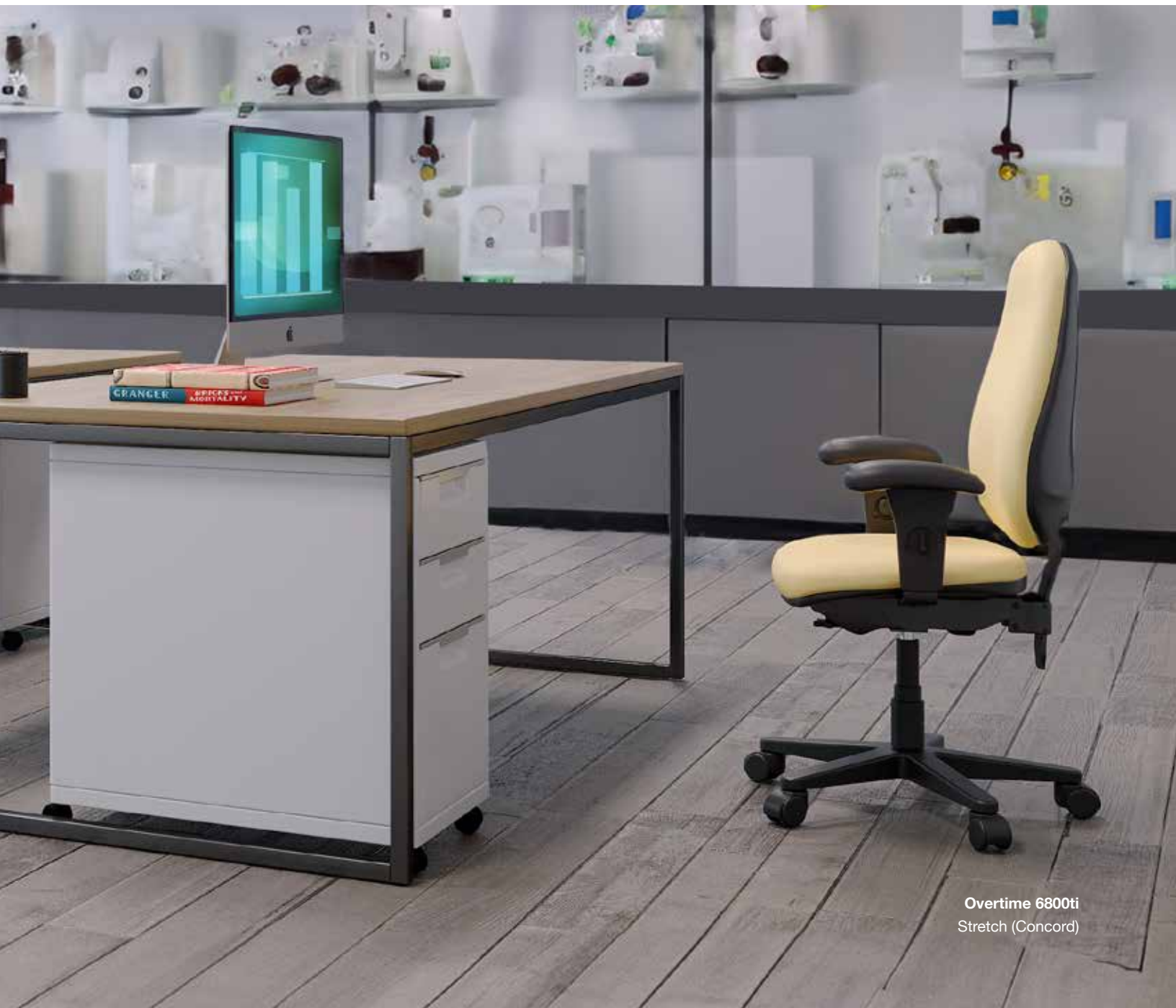
Overtime 6800ti Stretch (Concord)

Double overtime, night shifts, morning hours, round the clock bustle. This heavy-duty task chair can handle it all. The Overtime has a non-stop job to do, just like you. The chair is engineered to provide enduring comfort and support for individuals up to 300 pounds. A sturdy, adjustable back, high density foam, and swivel tilt mechanism make it ideal for 24 hour environments.