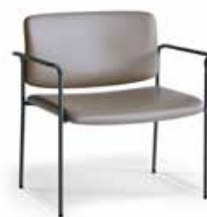
533 Armchair 500lbs capacity