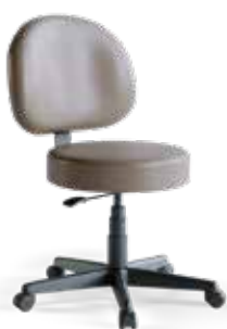
1000WB Stool with back