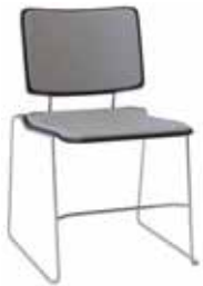
308UF High density stacker with upholstered seat and back, armless