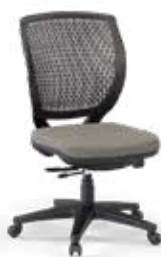
2200-07 Arm less chair