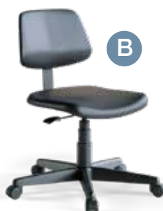
1010 Stool with polyurethane seat and back