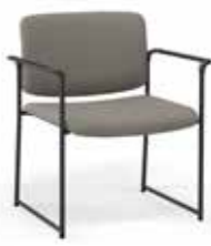
522 Sled base 400lbs capacity