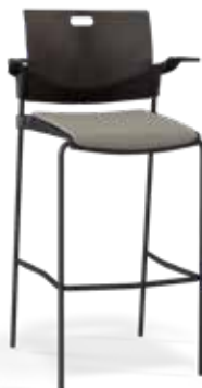
810UFST Barstool with arms, upholstered seat