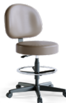
1009 High Stool with back