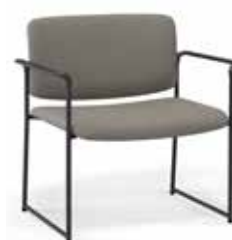
532 Sled base 500lbs capacity