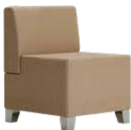
1401 Modular chair with back