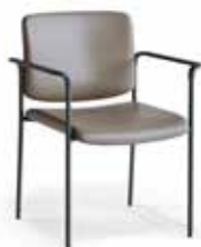
513 Armchair 300lbs capacity