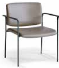
523 Armchair 400lbs capacity