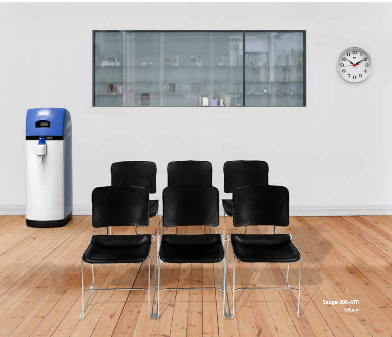
Sauga 300-ATR (Black)

The Sauga is a high-density, stackable chair. Comfortable enough for daily use and easy to store, the Sauga is an all-purpose stacker for educational, institutional, or group seating needs.