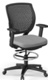
2200-DS Stool with arms