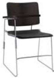
300ATR Side chair with tablet arm (Right handed)