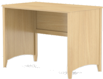
Student Desk No Ped 24x30x42