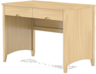
Student Desk No Ped-2 Pencil Drawers 24x30x42