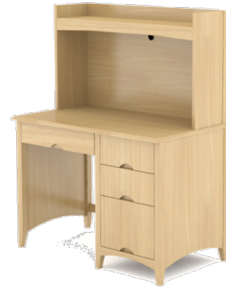
Student Desk Hutch Right Ped-4 Drawer 24x41x10