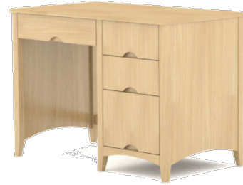
Student Desk 3 Drawer-Single Ped 24x30x42