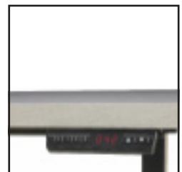
Unobtrusive Controls - easily and smoothly adjust tables under load. A deluxe option also displays the height and stores presets.