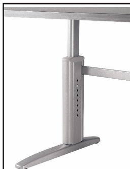
Pin Height Adjustable