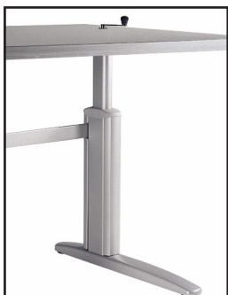
Crank Height Adjustable