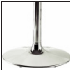
Tapered Pedestal Base - features a 3" column composed of .04" thick steel that gracefully transitions to the base.