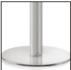
Disk Pedestal Base - features a 4" column composed of .04" thick steel with a welded