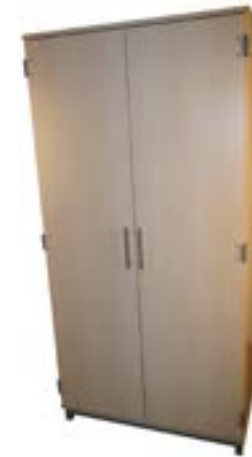
Appomattox Double Door Wardrobe 24"D x 36"W x 72"H, 270 degree hinges, cloths bar, laminate construction with vinyl edge treatment, metal base/legs, silver bar pulls, leveling glides. (AP W2D 3672)

VCE's Chesapeake line maximizes space-saving while offering a flexible solution.