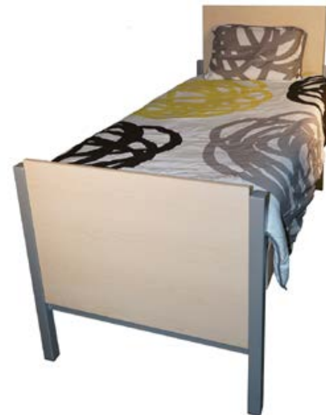
Appomattox Bed The Appomattox bed combines contemporary style with rugged construction