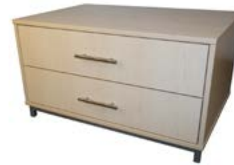
Appomattox Under Bed Chest 24"D x 30"W x 20"H, 2 drawer, laminate construction with vinyl edge treatment, metal base/legs, silver bar pulls, leveling glides. (AP 31001)