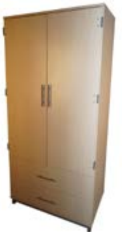
Appomattox Wardrobe/Chest Combo 24"D x 36"W x 78"H, 2 drawer, 270 degree hinges, cloths bar, laminate construction with vinyl edge treatment, metal base/legs, silver bar pulls, leveling glides. (AP W362478)