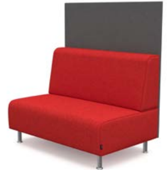
Hiline Lounge furnishings that bring functional design together with privacy to create a dynamic space for people to connect.