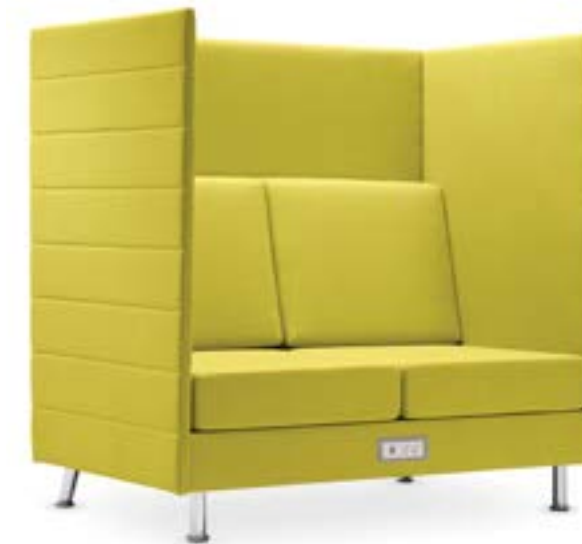
Atelier 2 Versatile soft seating that brings functional design together with privacy to create dynamic spaces for meeting, eating or focus work.