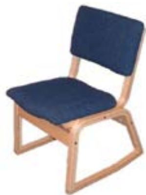
2 Position Chair VCE's 2 position chair is classically made from durable multi-ply maple wood