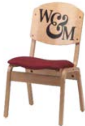
Logo Chair Add a personal touch with your college or university logo