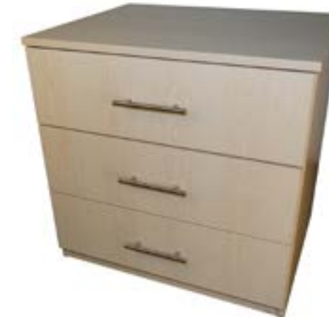
Chesapeake 3 Drawer Chest 24"D x 30"W x 30"H, laminate construction with vinyl edge treatment, silver bar pulls. (CP C330)