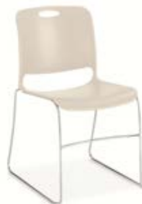
Piper Chair Strong, sleek, attractive stackable chairs