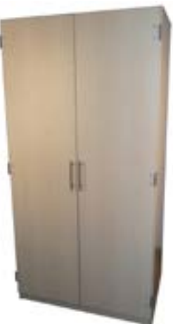
Chesapeake Double Door Wardrobe 24"D x 36"W x 72"H, 270 degree hinges, cloths bar, laminate construction with vinyl edge treatment, silver bar pulls, leveling glides. (CP W2D 3672)