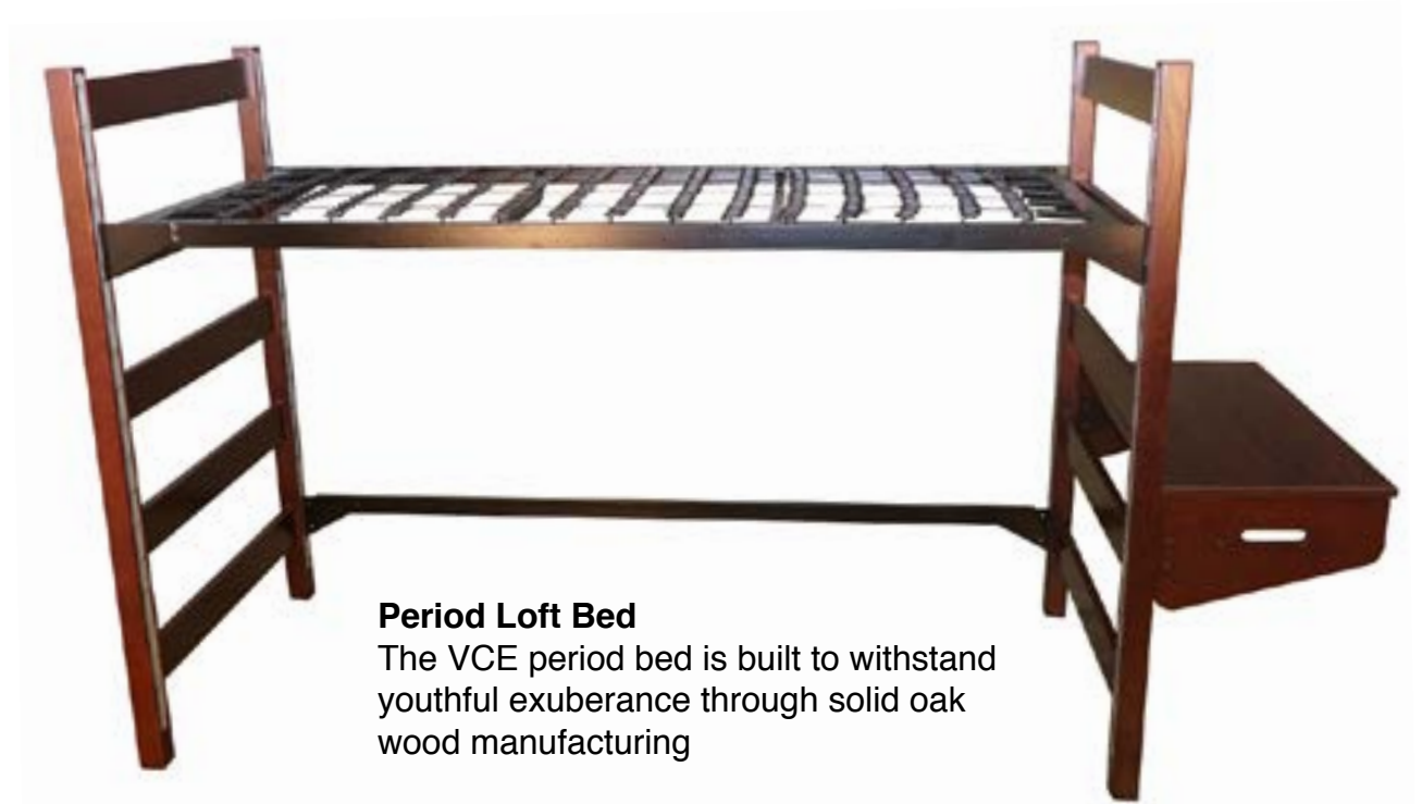
Period Loft Bed The VCE period bed is built to withstand youthful exuberance through solid oak wood manufacturing