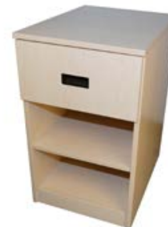
Chesapeake Single Drawer Nightstand 24"D x 18"W x 30"H, laminate construction with vinyl edge treatment, inset black metal pulls. (CP N110)

Appomattox contemporary style furnishings are designed for modern residence life requirements. The metal and laminate construction is not only rugged but attractive.