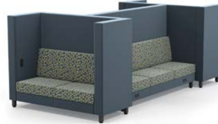
Junxion Lounge furnishings configured in infinite ways to meet the need for quiet and privacy – for focus or group work – in noisy, open spaces.