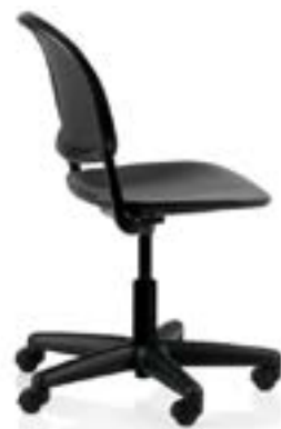
Navigator Chair The versatile Navigator Task Chair is specifically designed for today's modern residence life environments