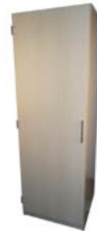
Chesapeake Single Door Wardrobe 24"D x 24"W x 72"H, 270 degree hinges, cloths bar, laminate construction with vinyl edge treatment, silver bar pulls, leveling glides. (CP W1D 2472)