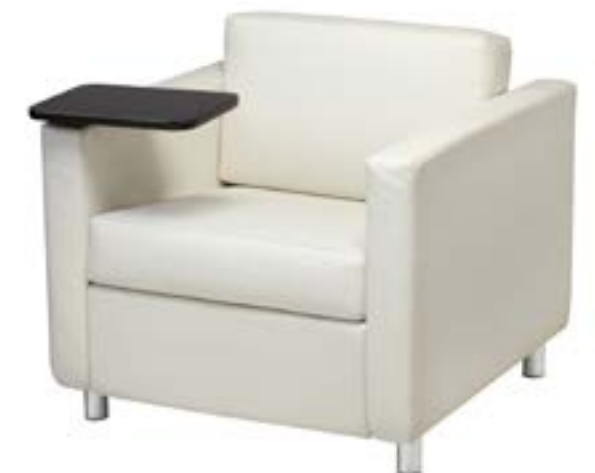
Danforth Modular seating that adds a classic presence to any space. Easy to move and easily assembled.

When students work together, great ideas are born and connections are made. People learn from one another. Rapidly changing technology has transformed the manner in which learning takes place. Today's active learning style requires fluid multi-purpose spaces that can be easily transformed for large groups, small teams or individual learning needs.